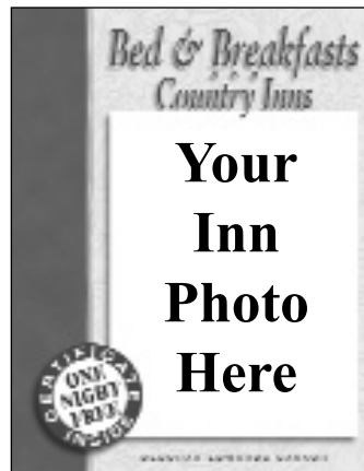
This year's 17th Edition

Bed & Breakfasts and Country Inns, 17th Edition - Custom Inn Version